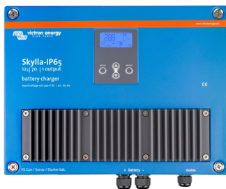
Skylla-IP65 12/60 (1+1)

To learn more about batteries and charging batteries, please refer to our book 'Energy Unlimited' (available free of charge from Victron Energy and downloadable from www.victronenergy.com ).