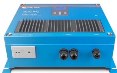
Skylla-IP65 12/60 (1+1)