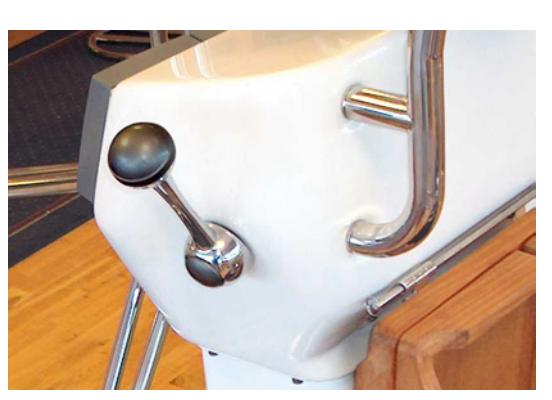
shown without cover plate

CH2800 Features unique twistgrip switch for control of Bow thruster or windlass. Polished stainless steel lever. Dual action design. Suits 3300/33c type cables.