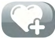
Automatic extension mode