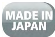
Made in Japan