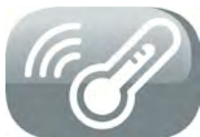
Room temperature thermistor