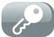
Child proof lock